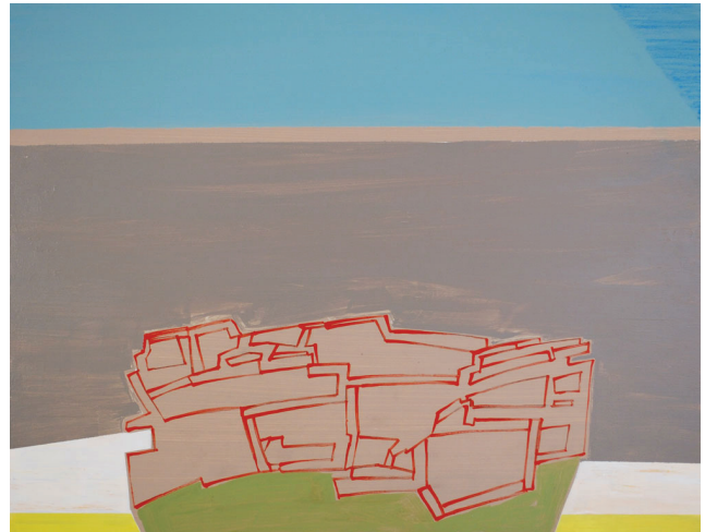
grid/box/y , 2009, acrylic on panel, 16.5 x 21.5 inches