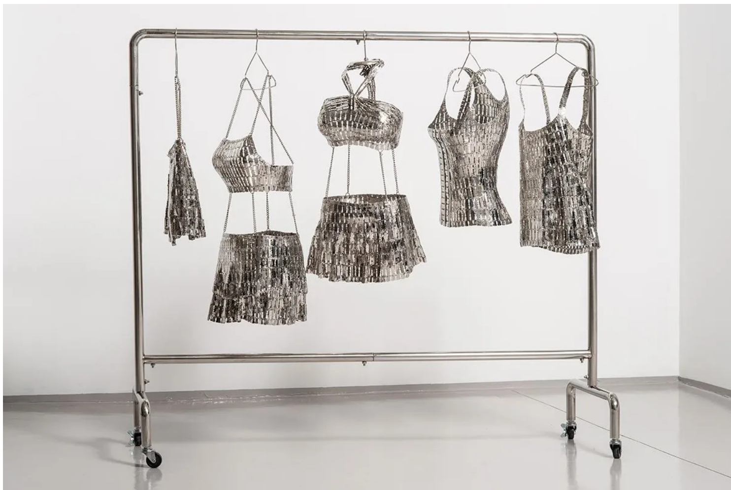
Bangladeshi installation artist Tayeba Begum Lipi's 'The Rack I Remember' will be on view at Singapore Art Week