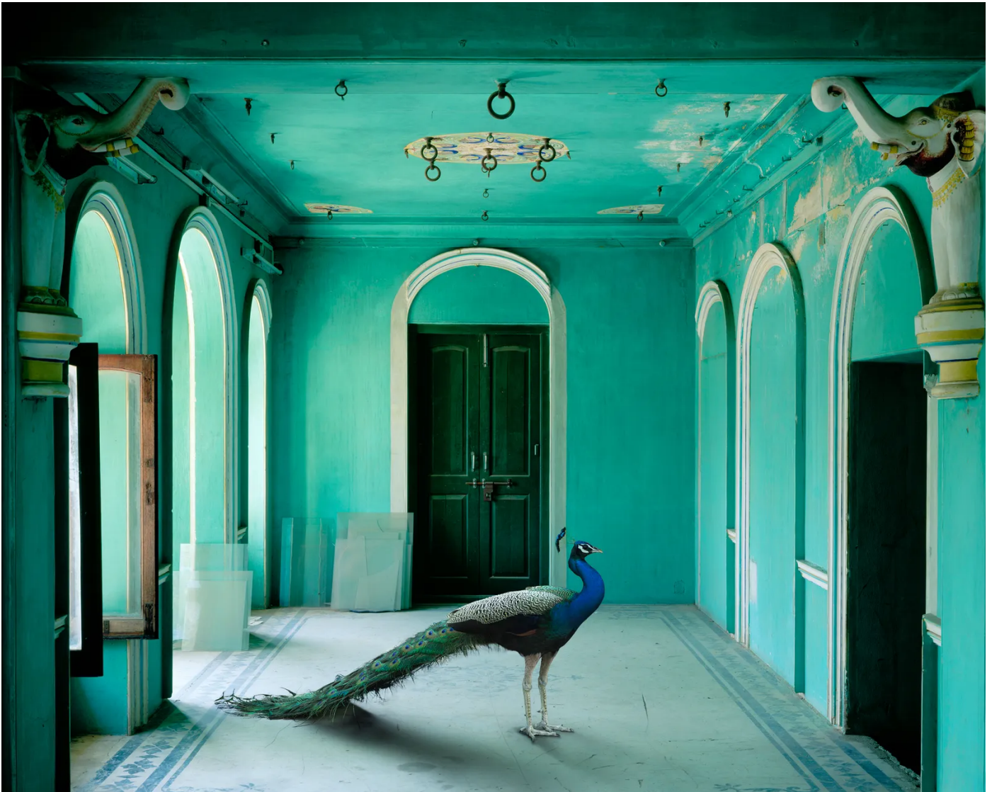
The Queen's Room, Zanana, Udaipur City by Karen Knorr

In her London-based practice, Knorr examines the meaning of place, drawing from ancient myths and allegories. ‘The Queen's Room’, Zenana, Udaipur City Palace, 2010 is a heady jade tinted room with a handsome peacock while ‘Faithful Companion’ at Samode Palace is an image that hints at reincarnation. Knorr employs grand interior spaces of palaces, temples and museums across Asia and Western Europe to frame issues of gender and class rooted in cultural heritage.