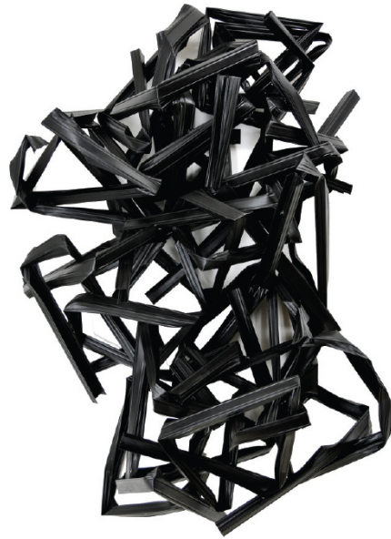
Left: Untitled (detail), 2014 Dye, ink and paper 104 30" x 39" Right: "TouchnFeel," 2013 Pure pigments and metal 64" x 48" x 17"

When working with paint, the opacity is as important as the hue. "I can't just paint color so it looks nice on the wall. Colors are nice. But how do you get colors to speak to you emotionally, rather than just visually...The application of pure pigments...getting the quality of the paint to be softer...[the process] is more than just something painted on a surface. It gives the quality of something that's in the surface...it's color, age and time." And he uses the colors symbolically. In his "Deltitnu" series, the mangles of metal are reminders of buildings destroyed in war. Black is an obvious choice, but they were also done in primary hues to—well, you decide.