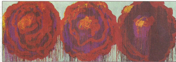
The Gagosian Gallery has works by a range of artists on its books, including pieces by (clockwise from above) Cy Twombly, Pablo Picasso, Andy Warhol, Richard Prince and Claude Monet.