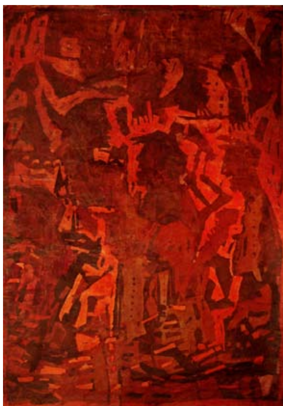
Georges Fikry Ibrahim The Farmer , 2006 Mixed media on paper, 33.9 x 93.3"

Arab artists? What role do Islam, the history of the region or the after-effects of Europe's colonial policy play in them? How much do they reflect biographical situations such as exile or global nomadism.