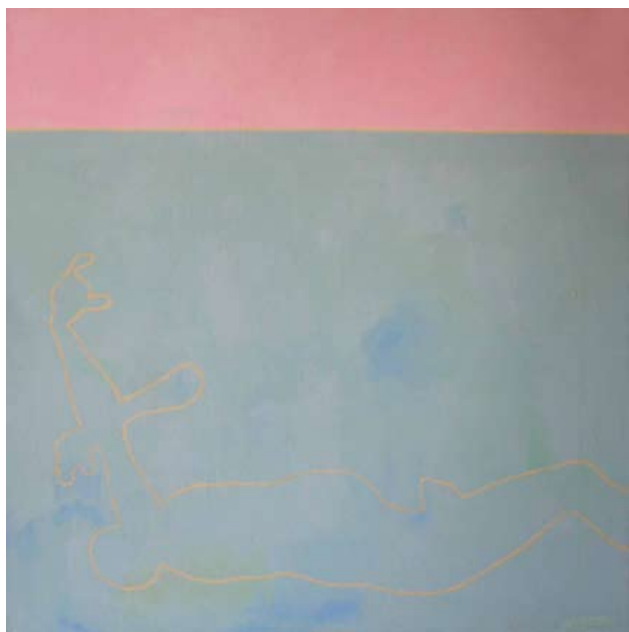
Ayman El Semary Deeping Quite , 2008 Acrylic, prayton, acrylic oxides on canvas, 59.1 x 59.1" 2008